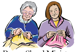
Prayer Shawl Ministry

It's winter, it's cloudy and cold, and colors are white and gray and sometimes drab or maybe a dramatic black...but spring is on the horizon and our hearts turn to the bright greens, yellows and oranges as the flowers begin to bloom. The