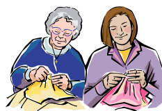
Prayer Shawl Ministry

A prayer shawl can offer warmth and comfort in trying times and during periods of grief. Each prayer shawl or lap robe is made with love and with every stitch we pray for the eventual recipient.