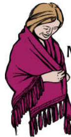
Prayer Shawl Ministry

Do you crochet?...Can you knit? If so we need you...if not we would love to help you learn! Along with a new skill you will get the joy of providing comfort and care to the hurt and bereaved among us by making Lap Robes and Prayer Shawls or providing a baby blanket to a